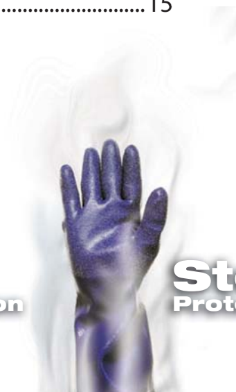
Liquid/ Steam Protection