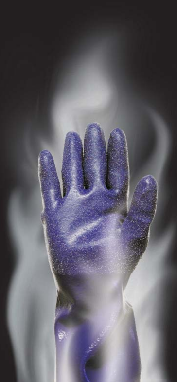
Liquid/ Steam Protection