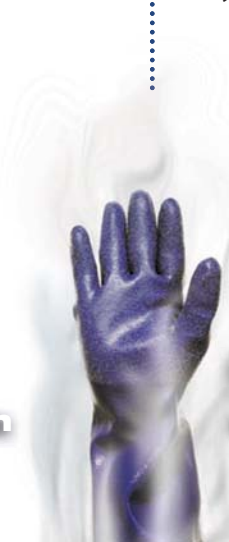
Liquid/ Steam Protection